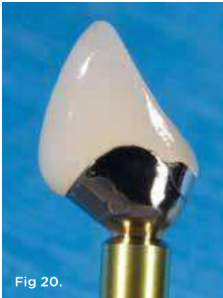
Fig 20. Final crowns were cemented on abutments extraorally. Fig 21. Patient's smile with final restoration and bonding on the premolars closing diastemas (laboratory work by Toshiyuki Fujiki, RDT). Fig 22 and Fig 23. Final radiographs showing excellent transition and fit among implant, abutment, and crown (implant placement by Leslie A. David, DDS).